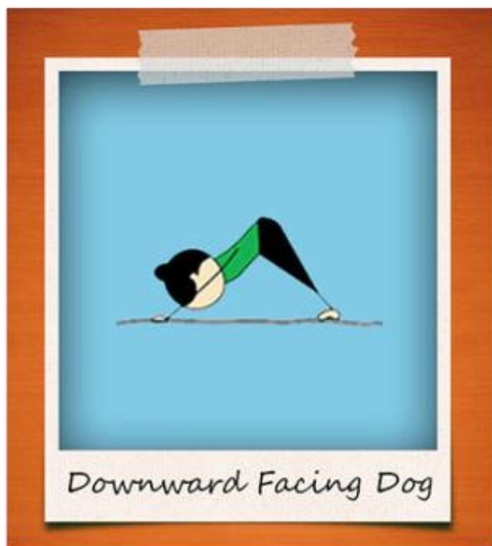
Downward Facing Dog